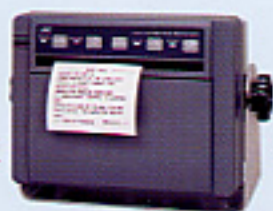
NAVTEX RECEIVER NCR-330